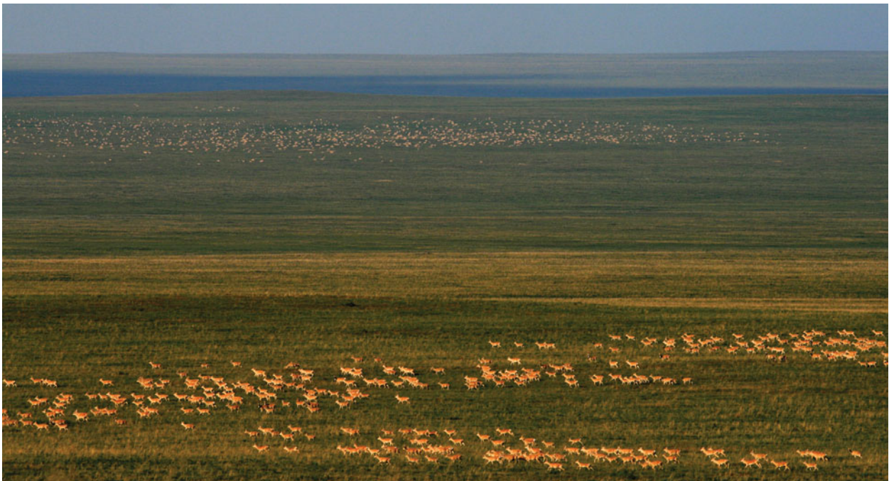
PLATE 1 Groups of Mongolian gazelles making up part of an aggregated herd of 200,000–250,000 seen in the eastern steppe of Mongolia on 12 September 2007 (Fig. 1). In the foreground, c. 325 gazelles can be seen. In the distance c. 1,100 are visible, and not visible on the far distant grasslands are thousands more.

This unusual and high concentration of gazelles is, at first consideration, a biological wonder and indicative of a species whose numbers have not yet been decimated by poaching or other causes. However, locations of good gazelle habitat vary considerably both within and among years depending on precipitation and drought conditions (Yu et al., 2004; Mueller et al., 2008). For example, during summer 2007 precipitation in some areas was well below