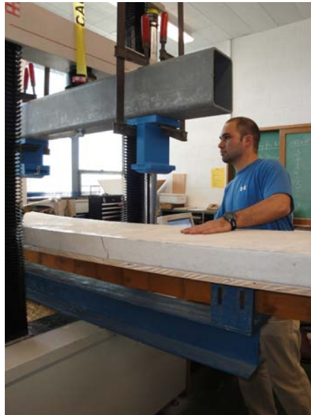
Sustainable Building Systems students often conduct studies on structural timber systems.

Research projects of current and past graduate students in the Sustainable Building Systems Concentration are varied, ranging from testing and computational modeling of structural composite materials to energy auditing and building diagnostics to forest products economics. Through their research projects, graduate students often employ or provide volunteer opportunities for interested undergraduates (over 240 in the Building and Construction Technology program alone). Graduate students are also encouraged to participate in projects and activities of their colleagues to broaden their experience and to provide and receive ideas and suggestions for improvements.