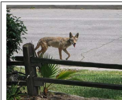
Working with wildlife and fisheries faculty, students get opportunities to investigate human-wildlife interactions.