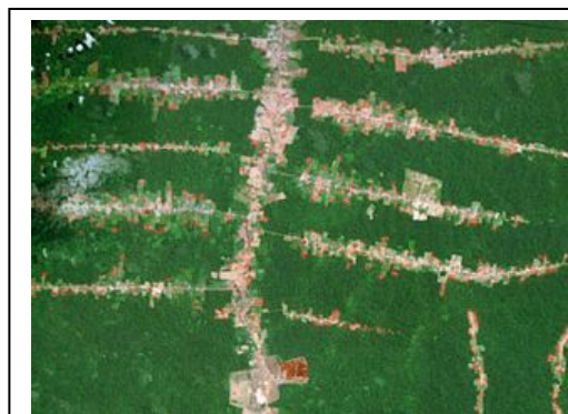
Students in ECo get opportunities to learn technologies and analytic approaches for studying human-induced landscape change.

*Note, students wishing to pursue a PhD with only a BS degree can choose to obtain a MS degree along the way toward completion of Ph.D. degree requirements. MS is not a requirement.