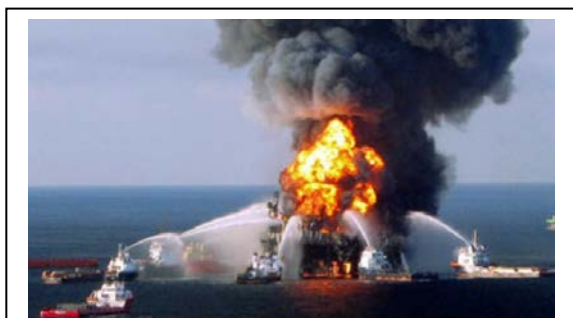
Through courses offered in ECo and in other affiliated departments at UMass, students get opportunities to contemplate environmental policies, human actions and outcomes on the environment.

At the MS level, students have the option of pursuing either a professional degree or thesis degree. The thesis/dissertation degree leads to the MS or PhD degree and centers around the completion of a major independent research project in addition to a modest coursework requirement. The professional degree leads to the MS degree and centers around a professional paper based on an internship/practicum in addition to a more substantial coursework requirement. Both degree options provide students a strong foundation in three core topic areas: environmental science (biology, ecology, conservation and environmental building design), 2) quantitative science (statistics, GIS and modeling), and 3) human dimensions (environmental policies, economics, politics, administration, management and values). The MS thesis degree is intended to prepare students for the option of pursuing a PhD and an eventual career in conservation science. The MS professional degree is meant to be a terminal degree for students seeking graduate-level training in a particular field of study and a career as a professional conservation scientist. Overall, the academic requirements of this concentration in combination with the