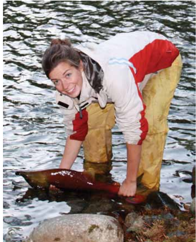
The author having fun with sockeye salmon research at Weaver Creek, B.C.

In an ideal world, an advisor should provide their students with the academic, financial, and personal support that they need to excel in graduate school. The advisor should have the academic qualifications and skills necessary to help you ensure that research projects are properly planned and executed, that the data are properly analyzed and interpreted, and that the re-