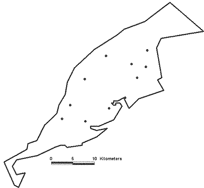
Figure 1. The camera trap station locations within the Waterberg Plateau Park.

The WPP, located in north-central Namibia (S20.46133, E17.20812), is a 470 km 2 area that was established in the 1970s for the protection of large herbivore species, including black and white rhinos (Schneider 1998). The plateau is characterized by 200-m high sandstone cliffs with deep sands on top. Average annual rainfall is between 400 and 500 mm (Mendelsohn et al. 2002), with most ground water seeping into underground springs that feed groundwater wells on the farms along the base of the escarpment. To the north-east, the plateau levels off with surrounding farmland. There are four different vegetation zones within the WPP: fountain plant communities, rocky outcrop communities, bush savannah and mixed tree and shrub woodland (Jankowitz 1983, Schneider 1998).