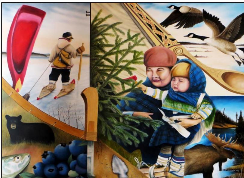
Painting in Cree Cultural Institute lobby by Tim Whiskeychan, Waskaganish Cree Nation, 2013